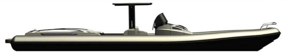
DARIEL YACHT DESIGN